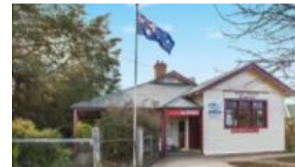
Bemboka Post Office